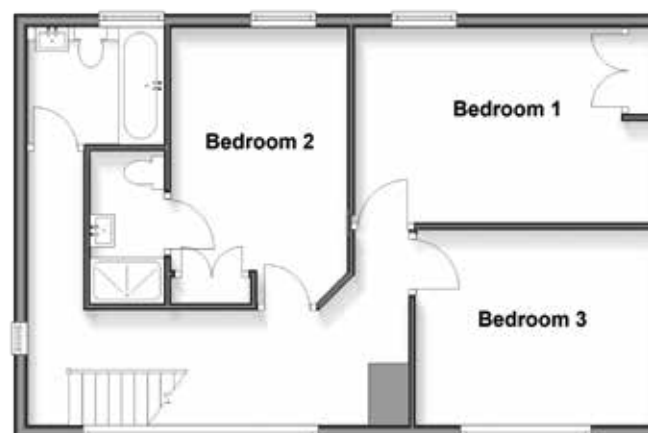
First Floor Approx. 58.5 sq. metres (629.6 sq. feet)

Front Garden Driveway Parking Rear Garden Workshop