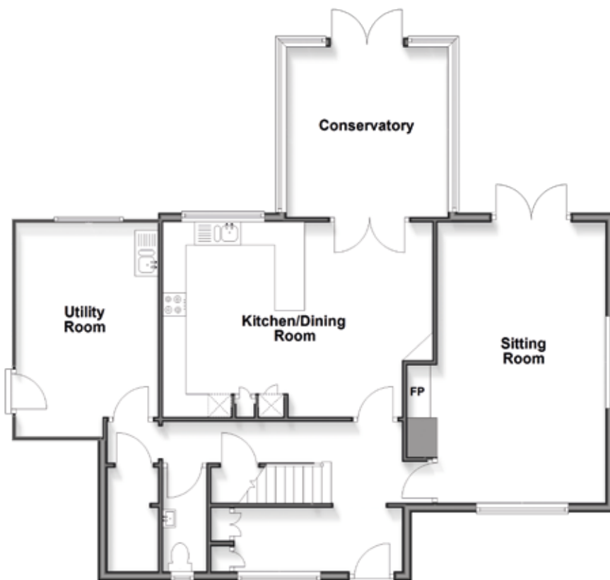
Ground Floor Approx. 97.9 sq. metres (1054.1 sq. feet)