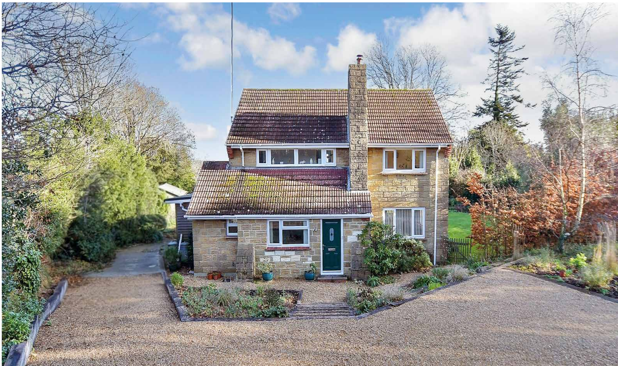
Bowlings Bedbury Lane | Freshwater | Isle of Wight | PO40 9PD