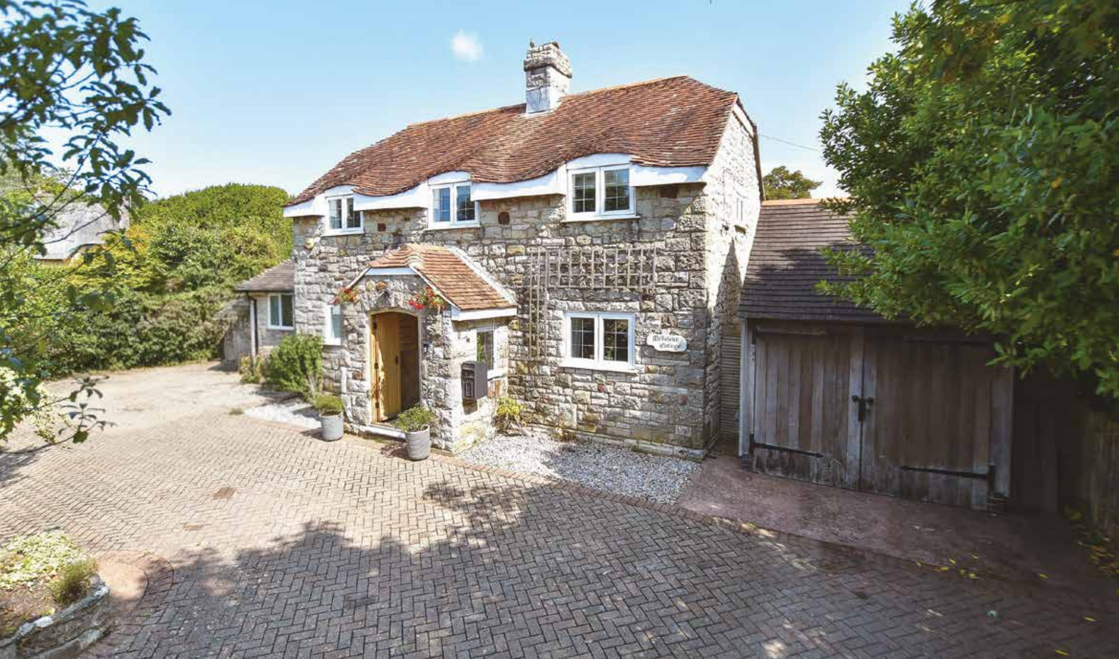
Millstone Cottage Main Road | Brighstone | Isle of Wight | PO30 4DJ