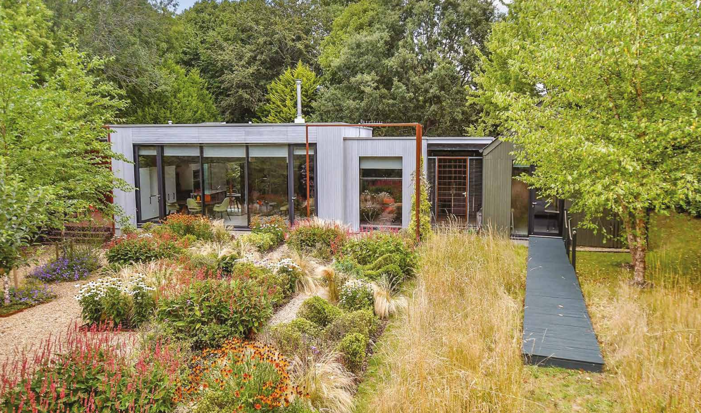
Woodland Cottage The Causeway | Freshwater | Isle of Wight | PO40 9TN