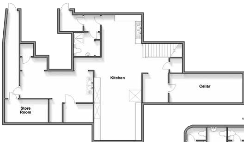
Ground Floor Approx. 118.6 sq. metres (1276.7 sq. feet)