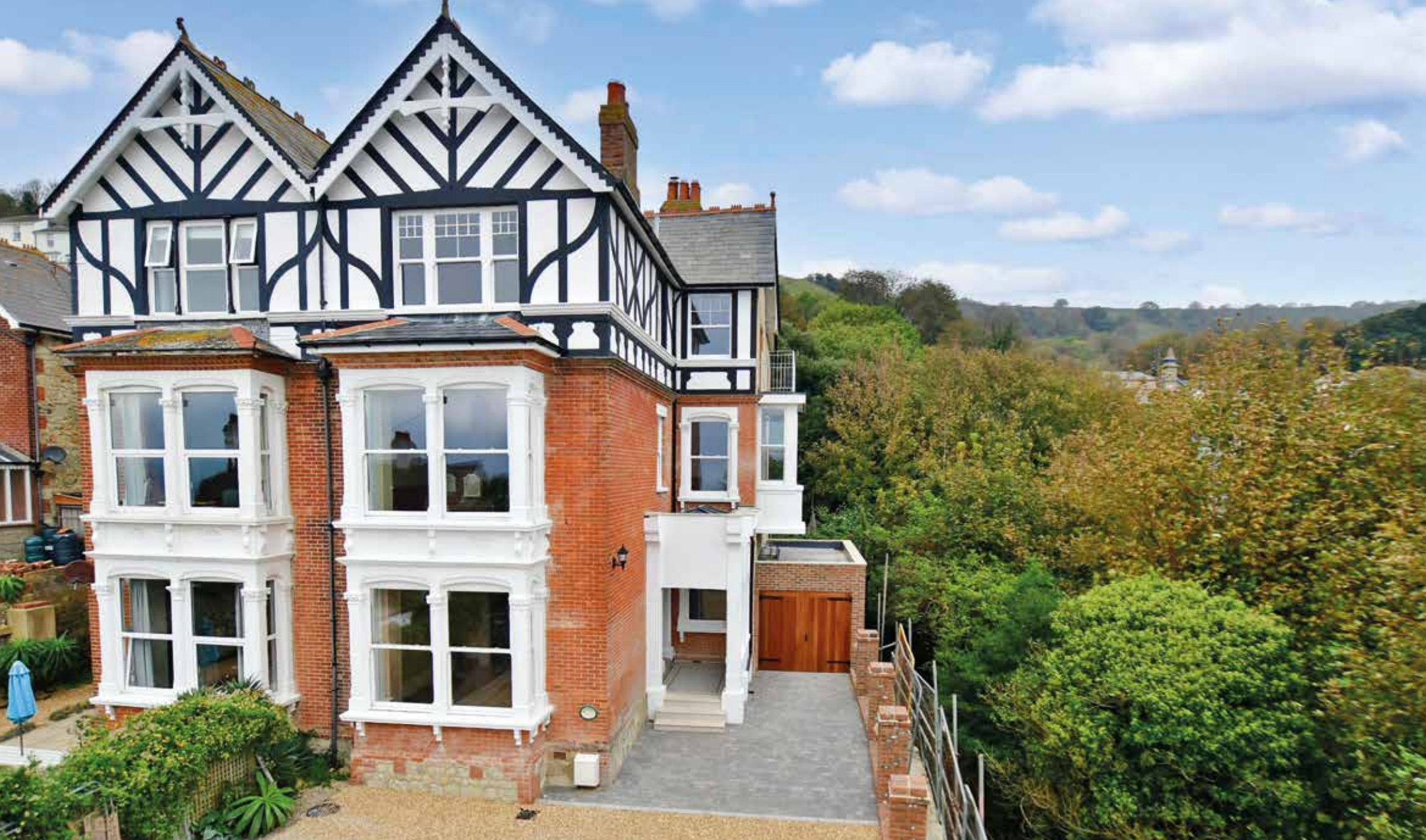
Delamere Bellevue Road | Ventnor | Isle of Wight | PO38 1DB