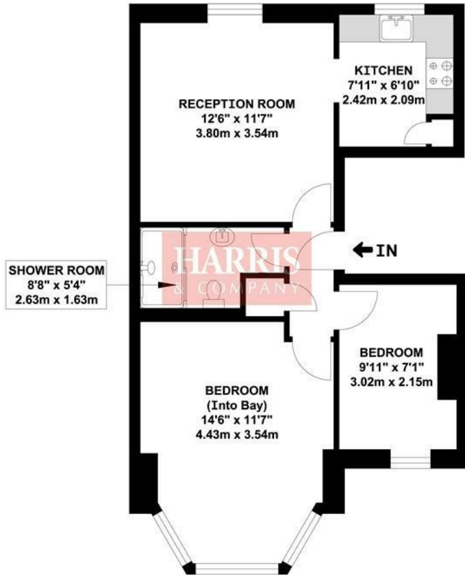
FIRST FLOOR FLAT

WHILST EVERY ATTEMPT HAS BEEN MADE TO ENSURE THE ACCURACY OF THE FLOOR PLAN CONTAINED HERE, MEASUREMENTS OF DOORS, WINDOWS, ROOMS AND ANY OTHER ITEMS ARE APPROXIMATE AND NO RESPONSIBILITY IS TAKEN FOR ANY ERROR, OMISSION, OR MIS-STATEMENT. THIS PLAN IS FOR ILLUSTRATIVE PURPOSES ONLY AND SHOULD BE USED AS SUCH, BY ANY PROSPECTIVE PURCHASER. FLOOR PLANS ARE NOT DONE TO "SCALE".