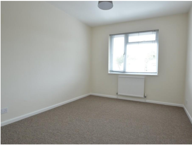
BEDROOM 1 14'11" x 11'9" Neutral décor with front aspect