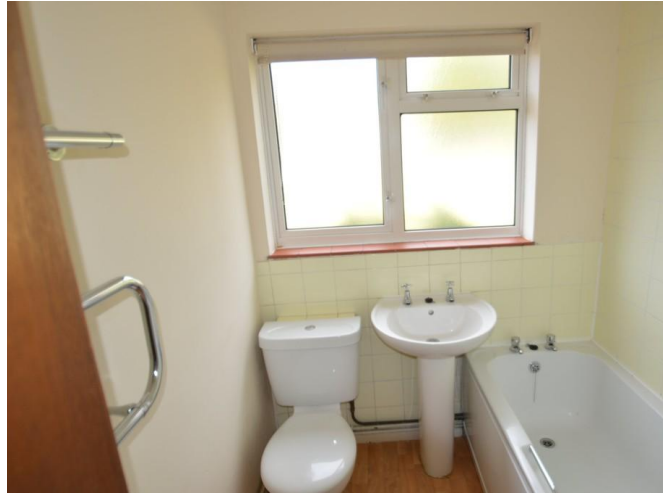
BATHROOM 5' 6" x 5' 6" (1.68m x 1.68m) White suite with double glazed window to front elevation, mains shower over bath. Sink and W.C