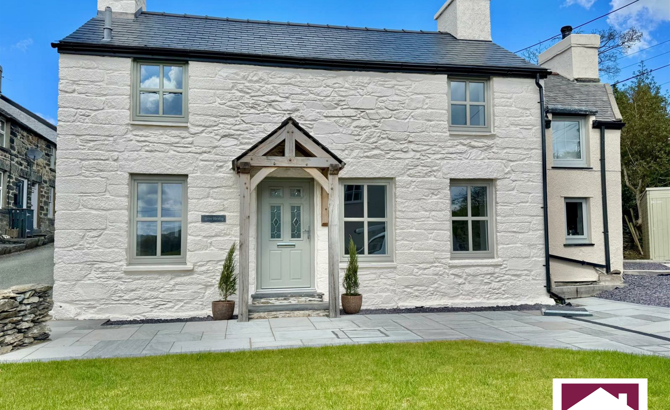
Bron Heulog Capel Garmon LL26 0RW