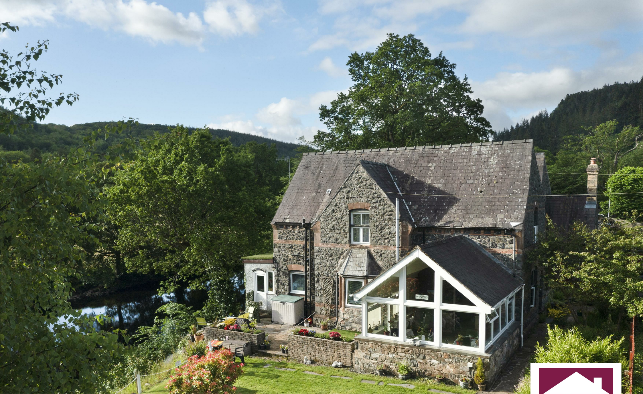
The Courthouse, Betws Y Coed LL24 0AL