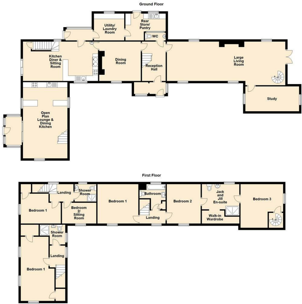
Floorplans are for identification purposes only and not to scale. Where measurements are shown, these are approximate and should not be relied on. Sanitary ware and kitchen fittings are representative only and approximate to actual shape, position and style. No liability is accepted in respect of any consequential loss arising from the use of the plan. Reproduced under licence from William Morris Energy Assessments. All rights reserved. Plan produced using PlanUp.

These particulars are intended only as a guide to prospective Purchasers to enable them to decide whether enquiries with a view to taking up negotiations but they are otherwise not intended to be relied upon in any way of for any purpose whatever and accordingly neither their accuracy nor the continued availability of the property is in any way guaranteed and they are furnished on the express understanding that neither the Agents nor the Vendor are to become under any liability or claim in respect of their contents. The Vendor does not hereby make or give or do the Agents nor does the Partner of the Employee of the Agents have any authority as regards the property of otherwise. Any prospective Purchaser or Lessee or other person in any way interested in the property should satisfy himself by inspection or otherwise as to the correctness of each statement contained in these Particulars. In the event of the Agent supplying any further information or expressing any opinion to a prospective Purchaser, whether oral or in writing, such information or expression of opinion must be treated as given on the same basis as these particulars.