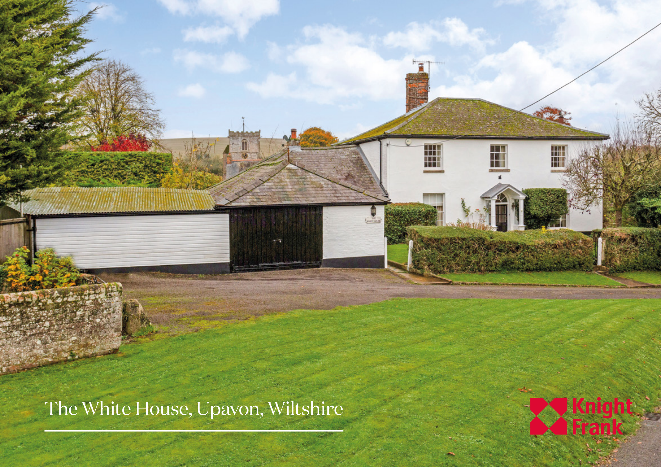
The White House, Upavon, Wiltshire