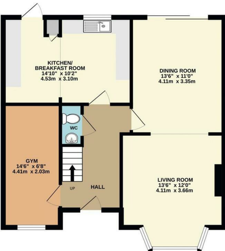
GROUND FLOOR 642 sq.ft. (59.6 sq.m.) approx.