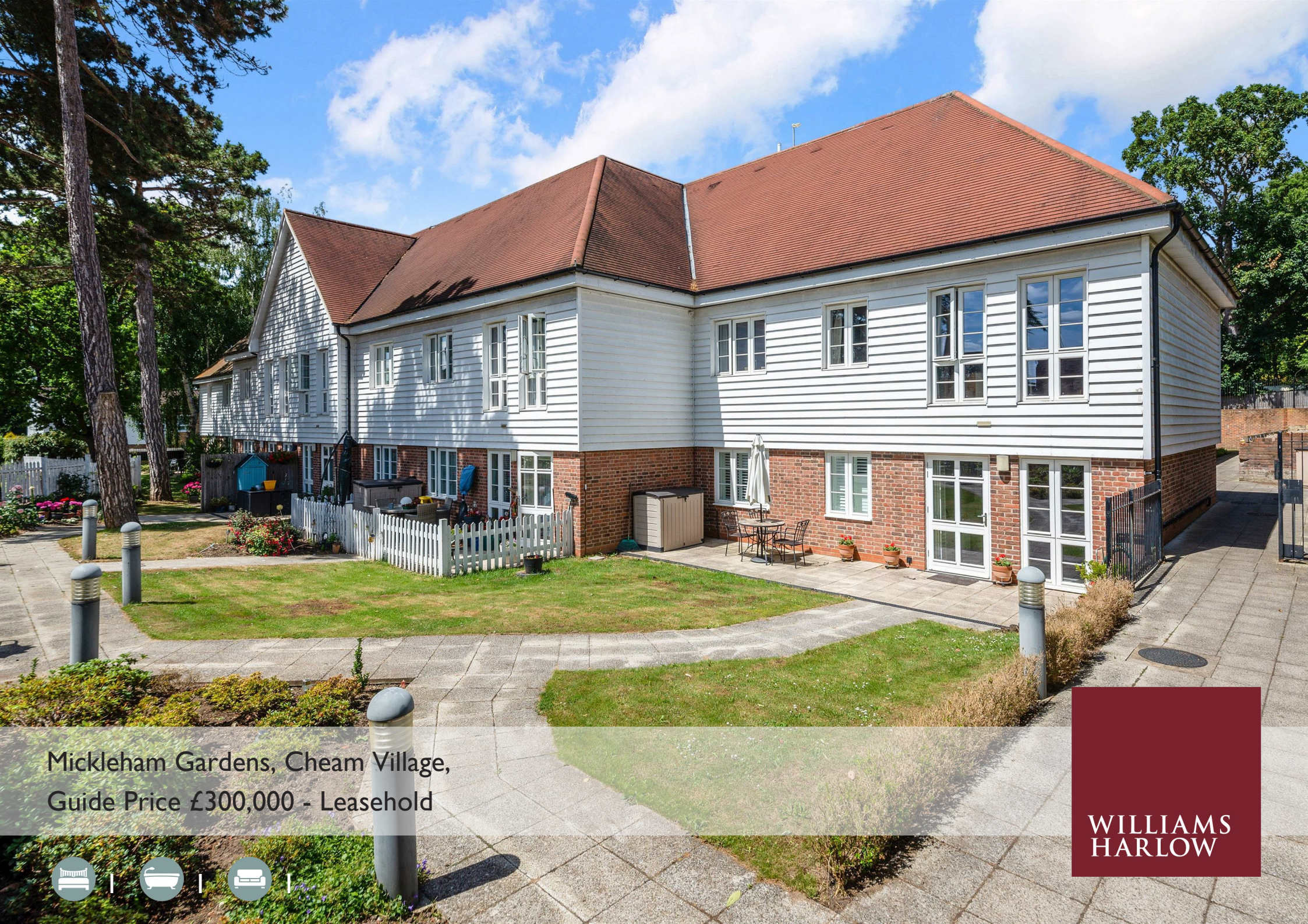
Mickleham Gardens, Cheam Village, Guide Price £300,000 - Leasehold