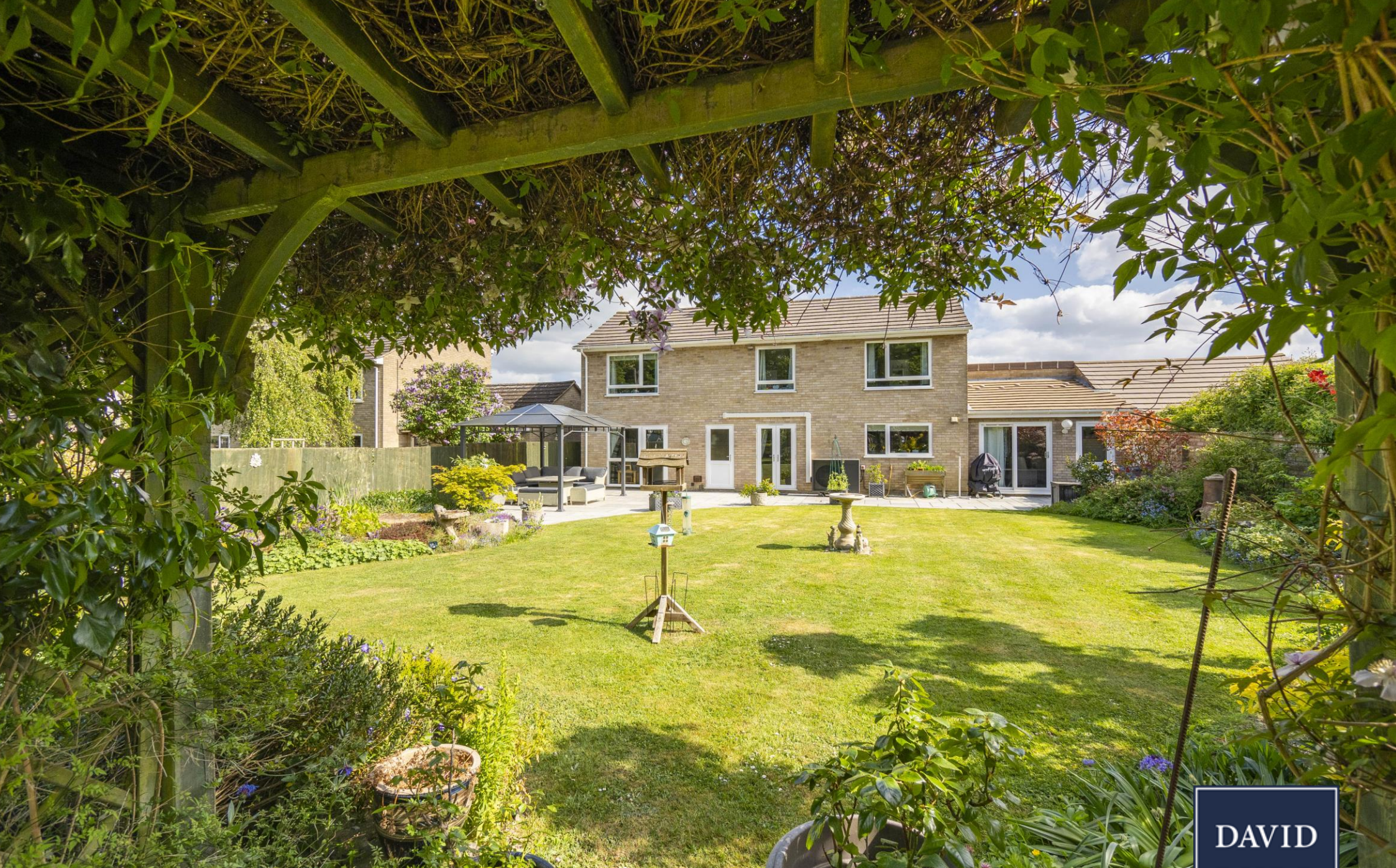
Ashcroft House 10 Streetfield Close, Shimpling