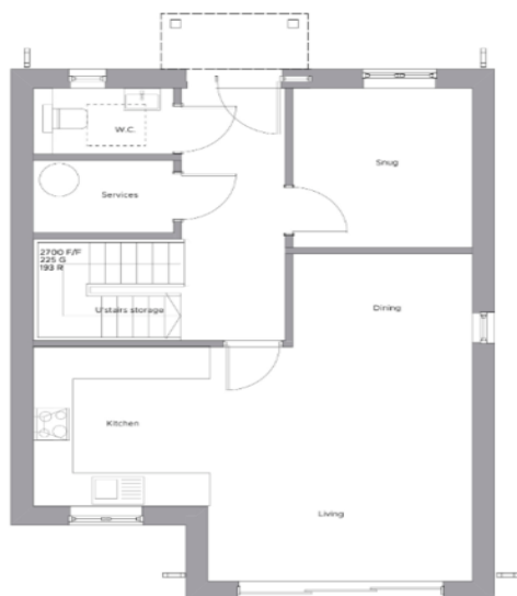
GROUND FLOOR PLAN Scale: 1:50

Plot 2, Oak Fields: is a beautifully designed two-bedroom detached home, offering the perfect blend of modern comfort and countryside charm. With off-road parking, a spacious rear garden, and gated side access, this home enjoys a picturesque backdrop of open fields, creating a truly peaceful setting. Step inside to discover a thoughtfully designed layout, featuring a versatile office/snug room, a dedicated plant room, a convenient ground-floor W/C, and a stunning open-plan kitchen/living space that seamlessly connects to the rear garden—perfect for entertaining and everyday living. Upstairs, both bedrooms are generously sized doubles, with the luxurious Master suite boasting a private ensuite and a walk-in wardrobe. A stylish family bathroom completes the first floor, offering both comfort and functionality.