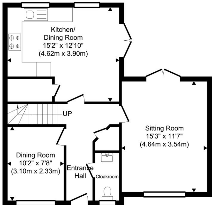
Ground Floor Approximate Floor Area 584.58 sq. ft. (54.31 sq. m)