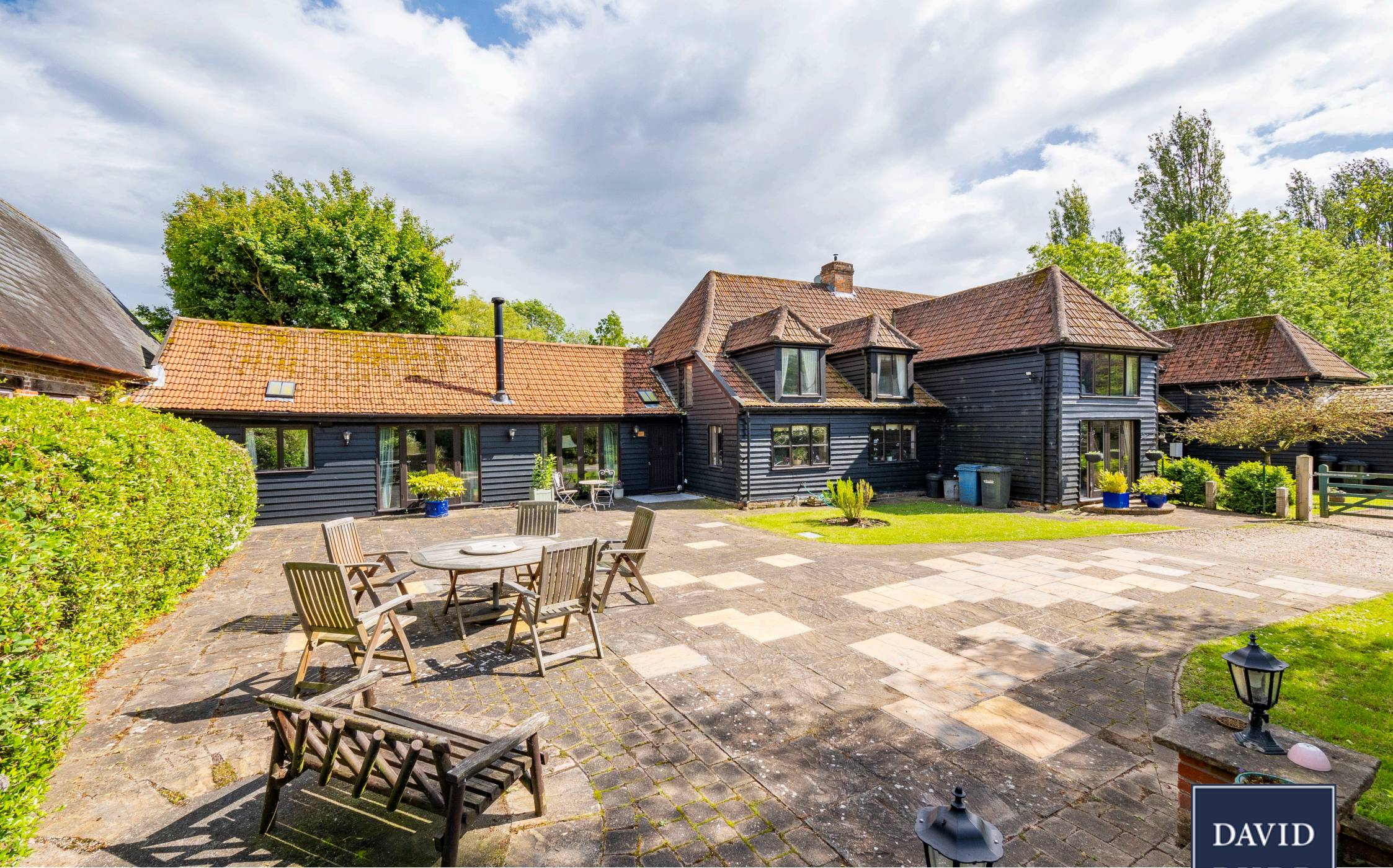
Preston Barn, The Street, Preston St. Mary, Suffolk