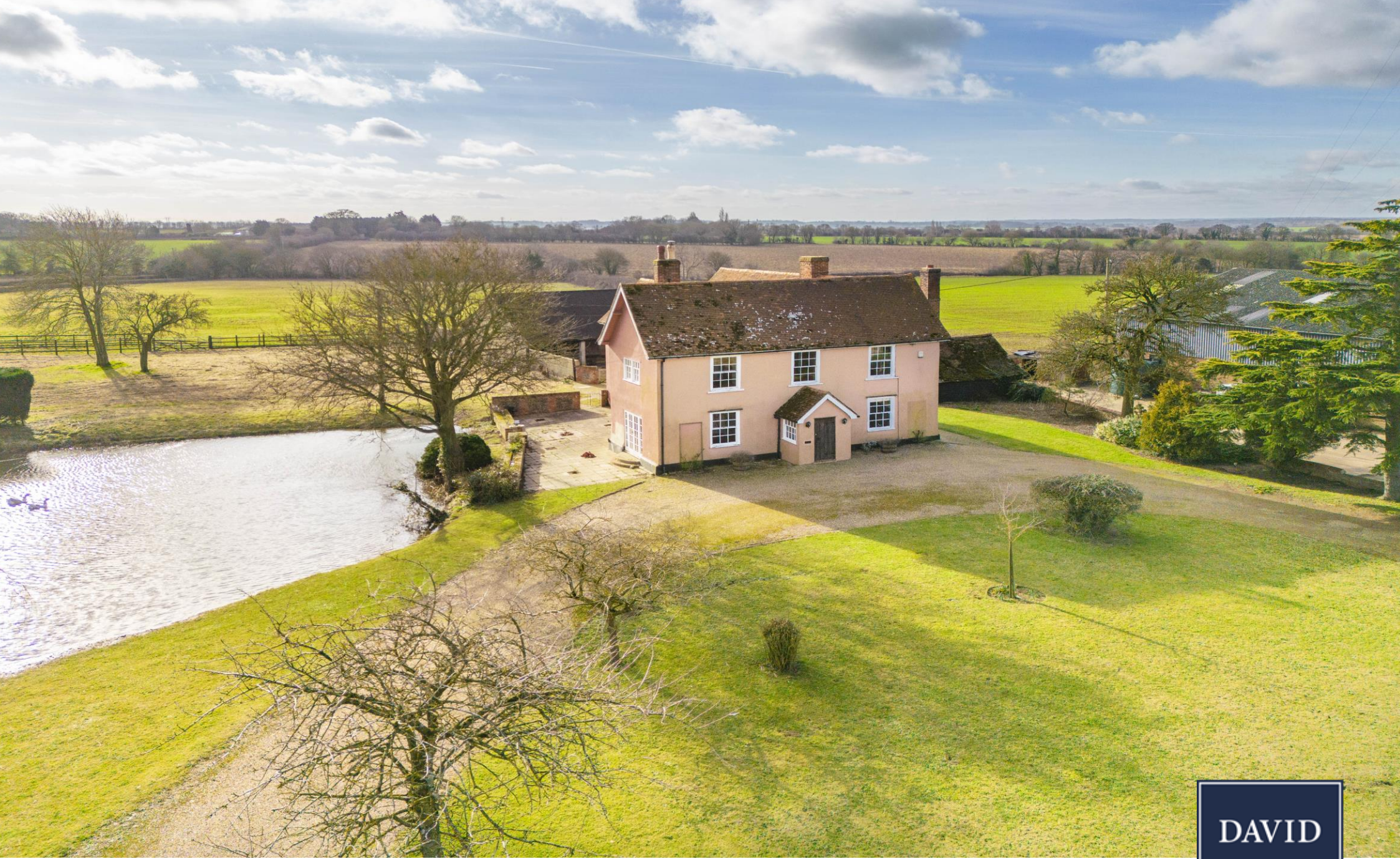
Cuckoo Tye Farmhouse, Cuckoo Tye, Acton, Suffolk