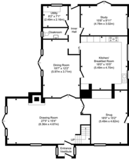
Ground Floor Approximate Floor Area 1508.45 sq. ft. (140.14 sq. m)