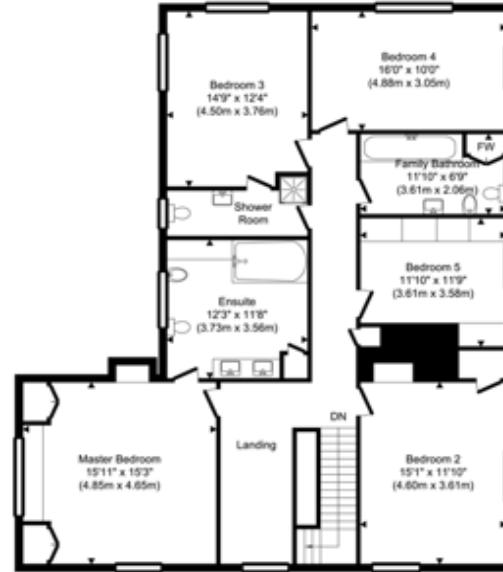
First Floor Approximate Floor Area 1482.19 sq. ft. (137.70 sq. m)