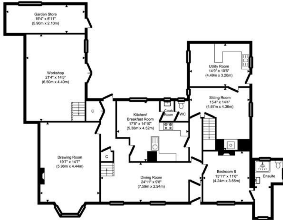
Ground Floor Approximate Floor Area 1980.02 sq. ft. (183.95 sq. m)