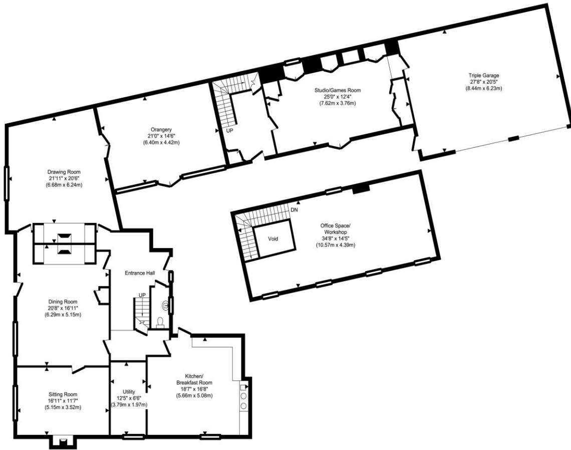
Ground Floor Approximate Floor Area 2951.57 sq. ft. (274.21 sq. m)