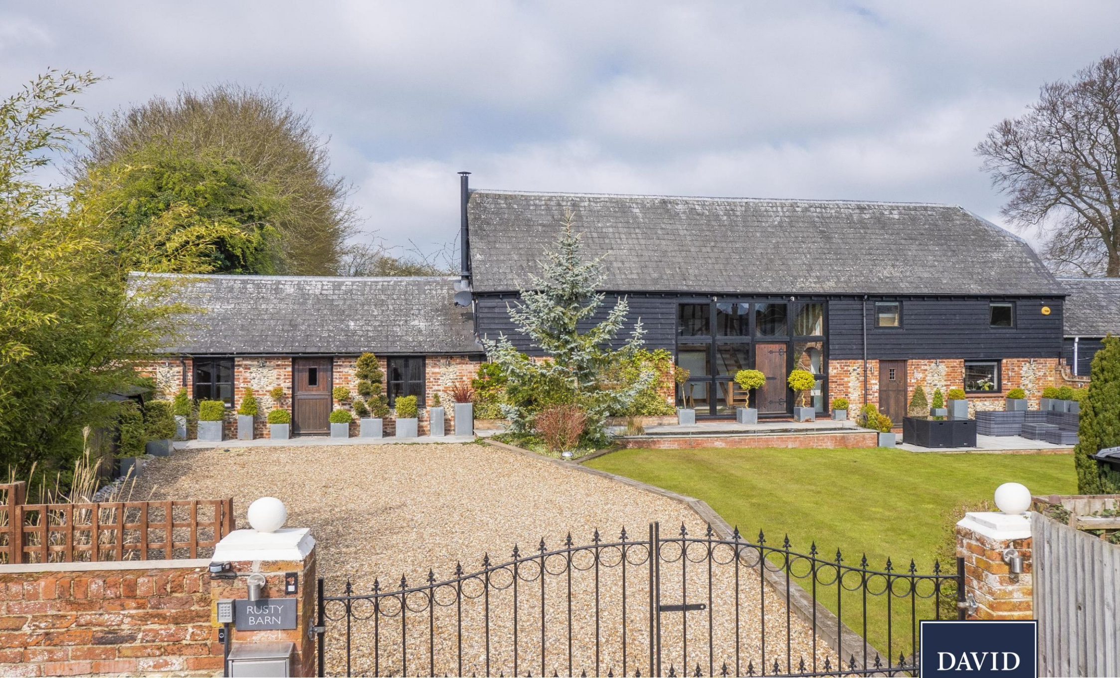
Rusty Barn The Street, Sturmer