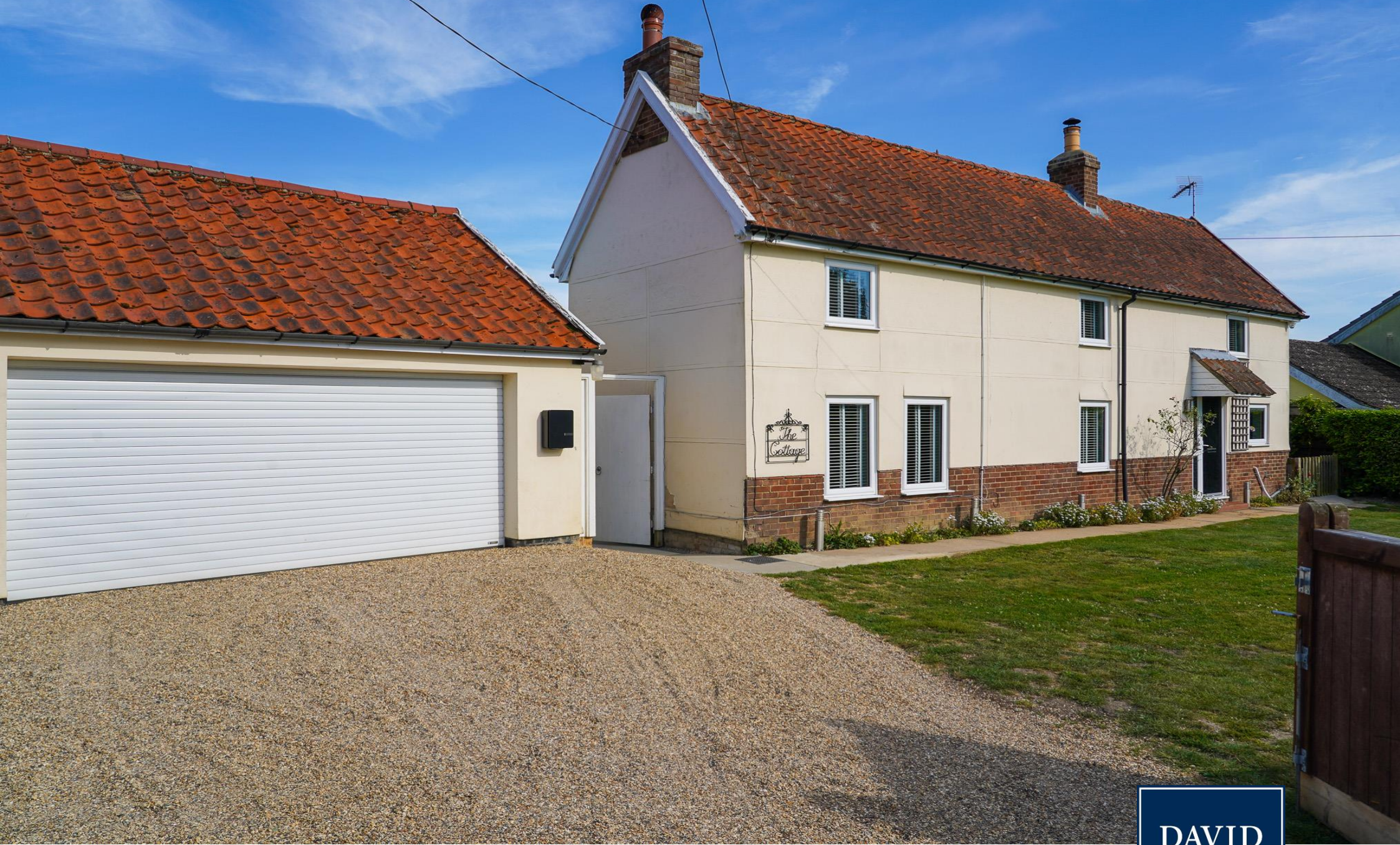
The Cottage, Fenstead End, Bury St. Edmunds, Suffolk