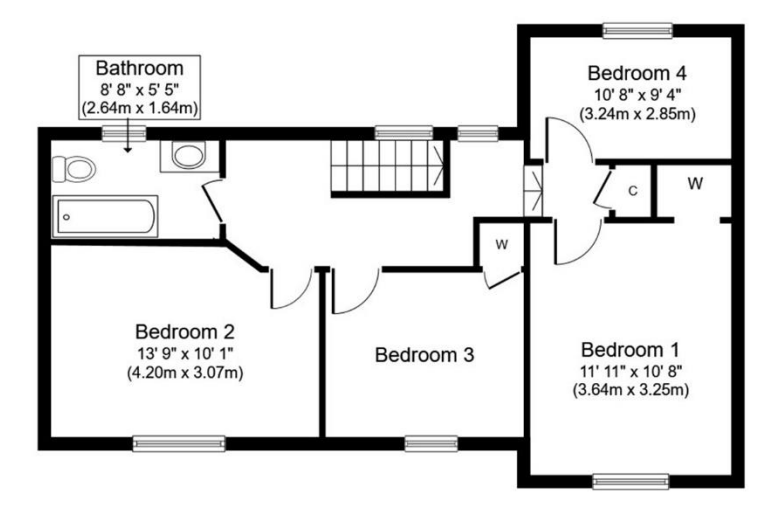
First Floor Approximate Floor Area 608 sq. ft. (56.5 sq. m.)