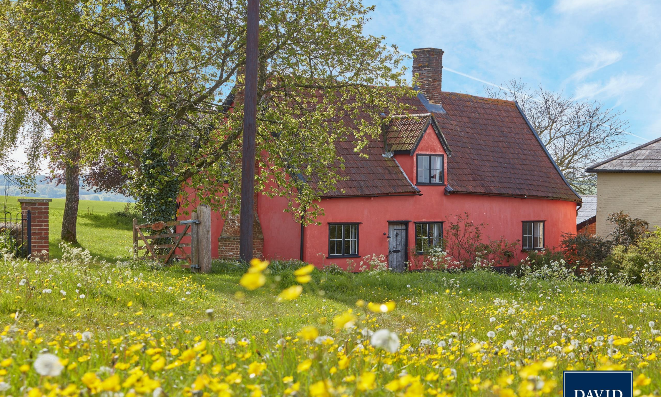
The Old Cottage Hawkedon, Bury St Edmunds, Suffolk