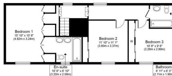
First Floor Approximate Floor Area 764 sq. ft. (71.0 sq. m.)