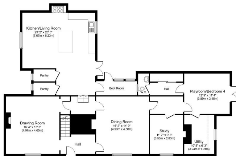
Ground Floor Approximate Floor Area 1,636 sq. ft. (152.0 sq. m.)