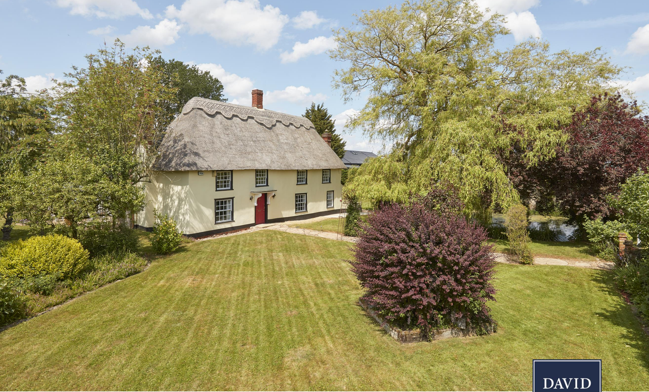
Peacocks Farm House Farley Green, Suffolk