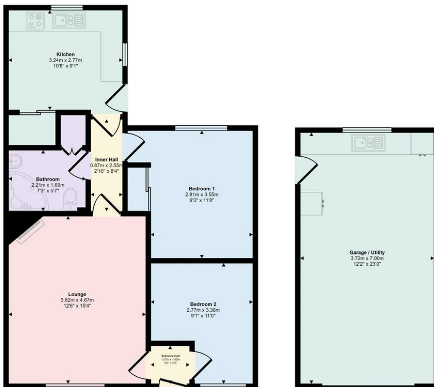
Floorplan Approx 59 sq m / 634 sq ft

Approx Gross Internal Area 85 sq m / 915 sq ft