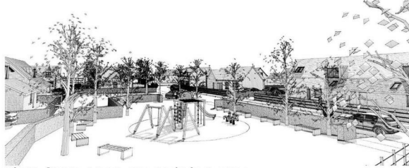
view from open space/play area