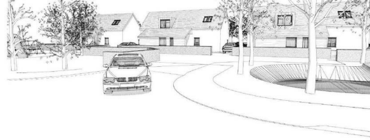
view looking towards plot 8, 9 & 10