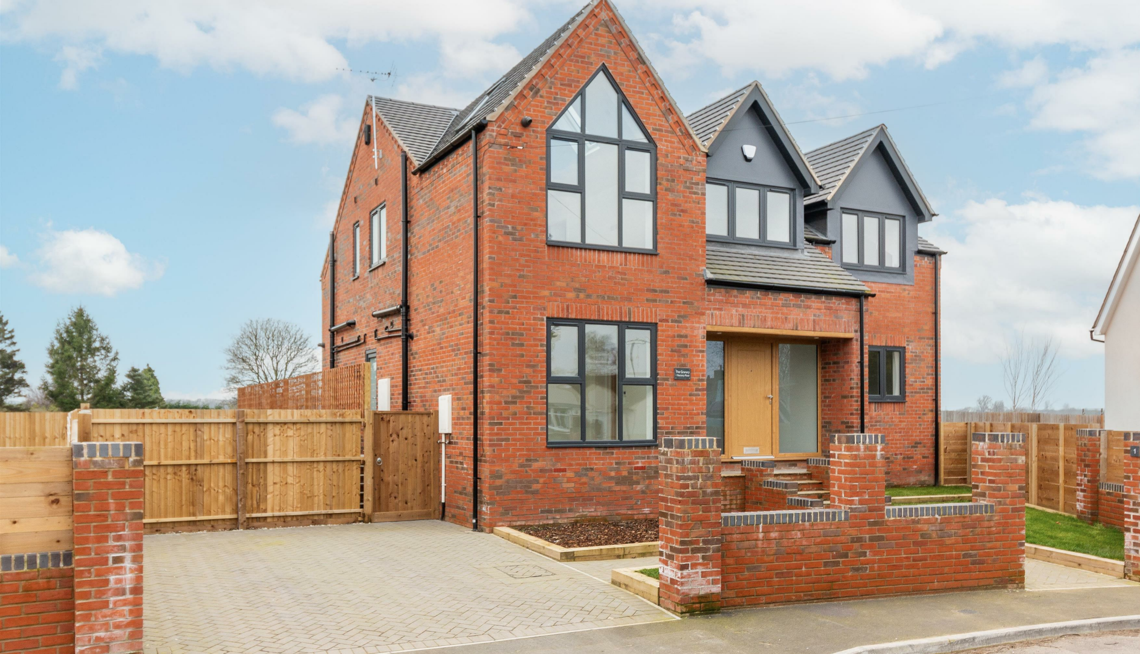
The Granary Rectory Place,, Barton-In-Fabis, NG11 0AA