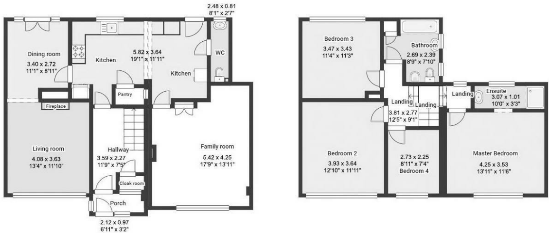
FLOORPLAN IS FOR ILLUSTRATIVE PURPOSES ONLY All measurements walls, doors, windows, fittings and appliances, their sizes and locations are an approximate only. They cannot be regarded as being a representation by the seller nor their agent and is for identification only. Not to scale.