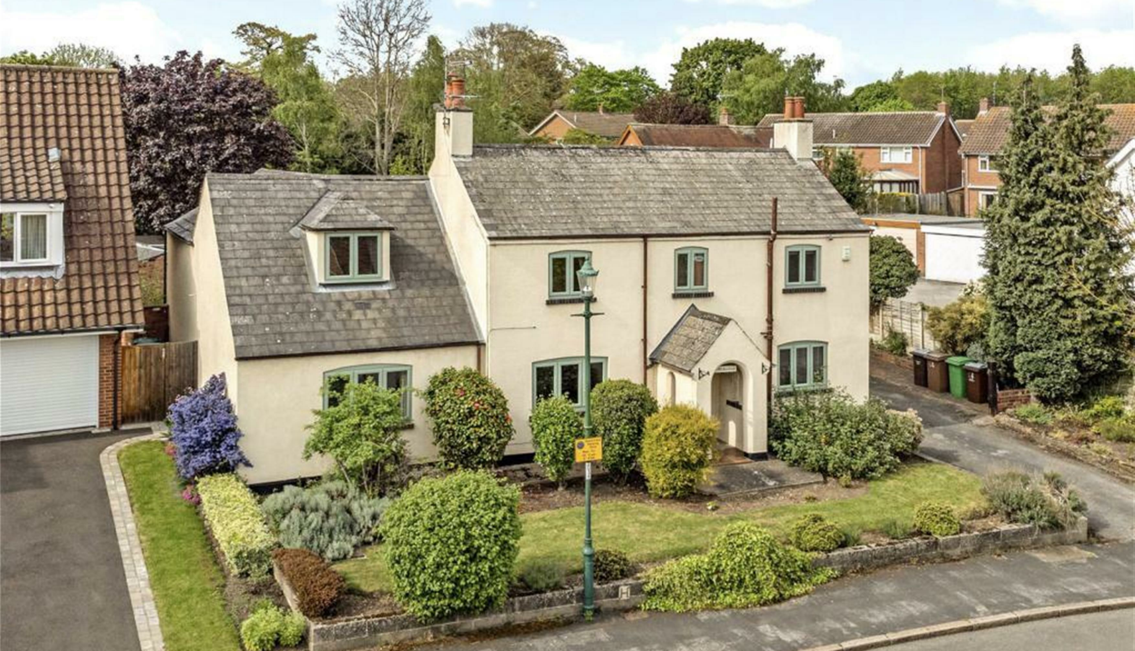
The Old Farmhouse, 64 Village Road, Clifton Village, NG11 8NE