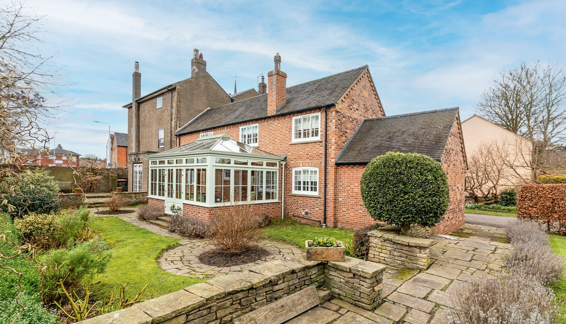
Claremont House, 20 Market Place, Kegworth, DE74 2EE