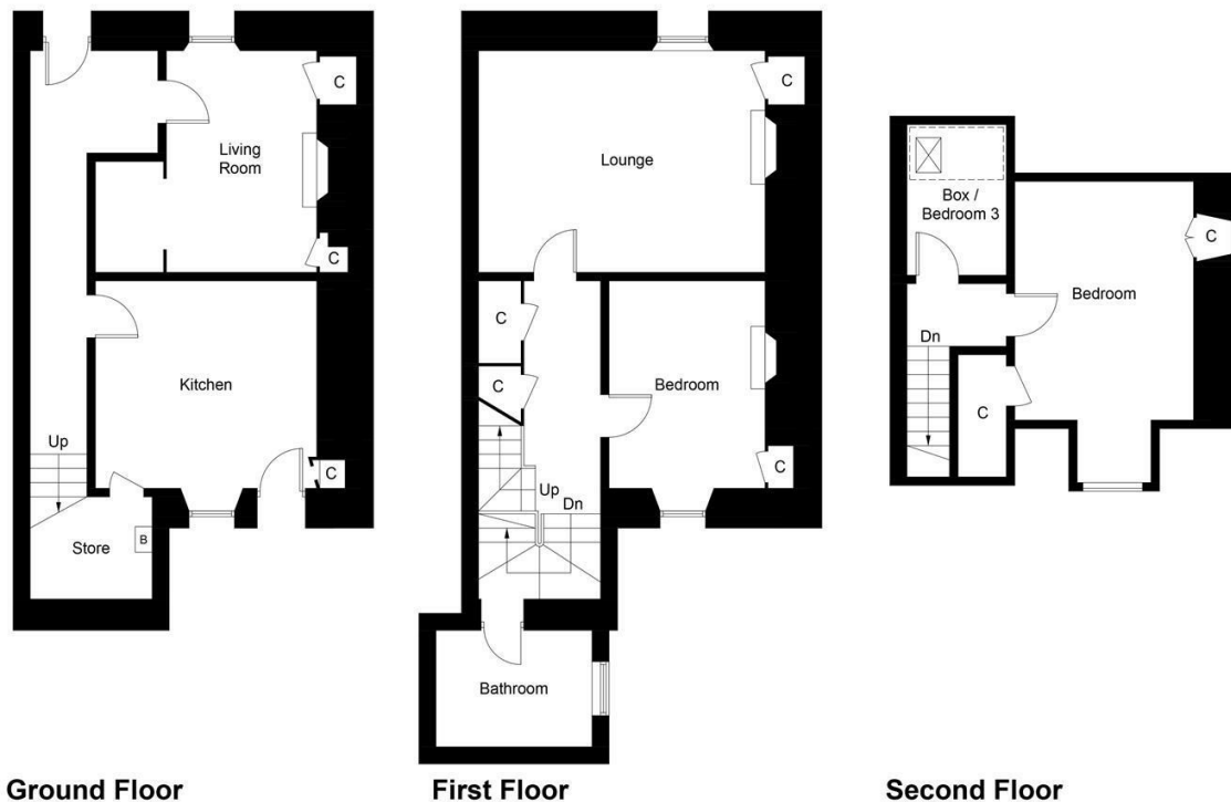
Illustration for identification purposes only, measurements are approximate, not to scale. (ID1019288)