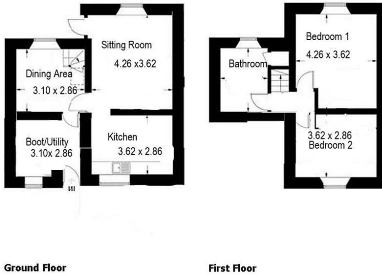
Illustration for identification purposes only measurements are approximate