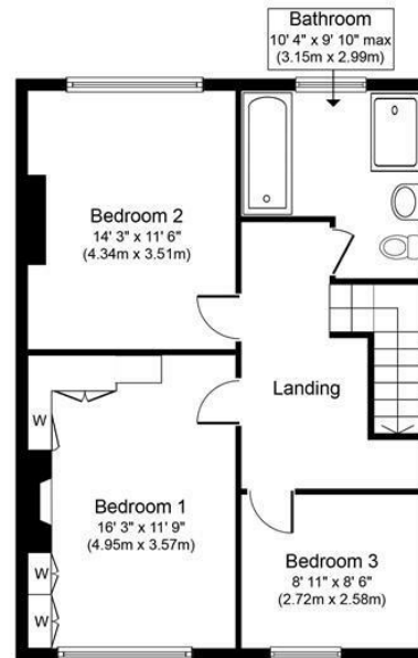
First Floor Approximate Floor Area 668 668 sq. ft. (62.1 sq. m.)

Whilst every attempt has been made to ensure the accuracy of the floor plan contained here, measurements of doors, windows, rooms and any other items are approximate and no responsibility is taken for any error, omission, or mis-statement. The measurements should not be relied upon for valuation, transaction and/or funding purposes. This plan is for illustrative purposes only and should be used as such by any prospective purchaser or tenant. The services, systems and appliances shown have not been tested and no guarantee as to their operability or efficiency can be given. Copyright V360 Ltd 2024 | www.houseviz.com