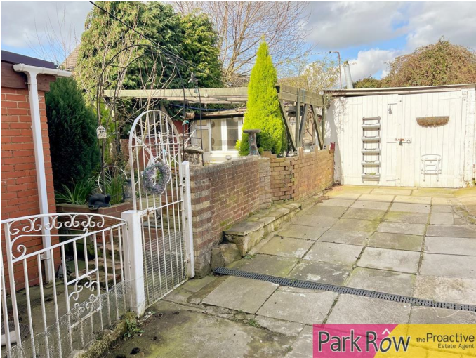
Secure garden. Outbuilding with power and sockets. Garage.