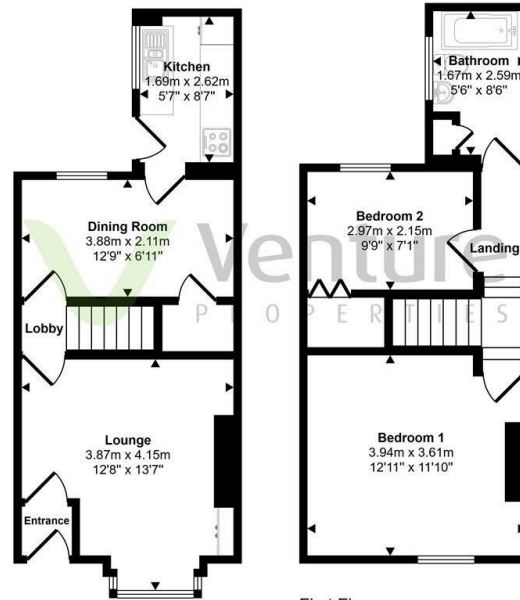
Ground Floor Approx 32 sq m / 343 sq ft

Approx Gross Internal Area 64 sq m / 688 sq ft