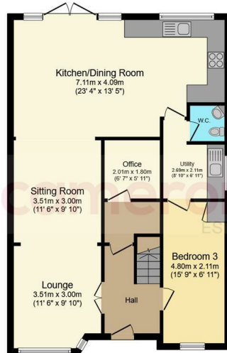
Ground Floor Floor area 79.0 sq.m. (851 sq.ft.)