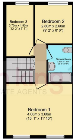
First Floor Floor area 41.9 sq.m. (451 sq.ft.)

Total floor area: 85.9 sq.m. (925 sq.ft.)