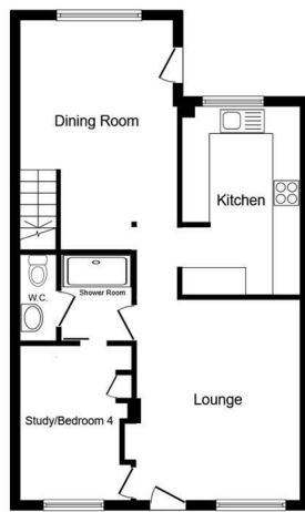
Ground Floor Floor area 59.5 m 2 (641 sq.ft.)