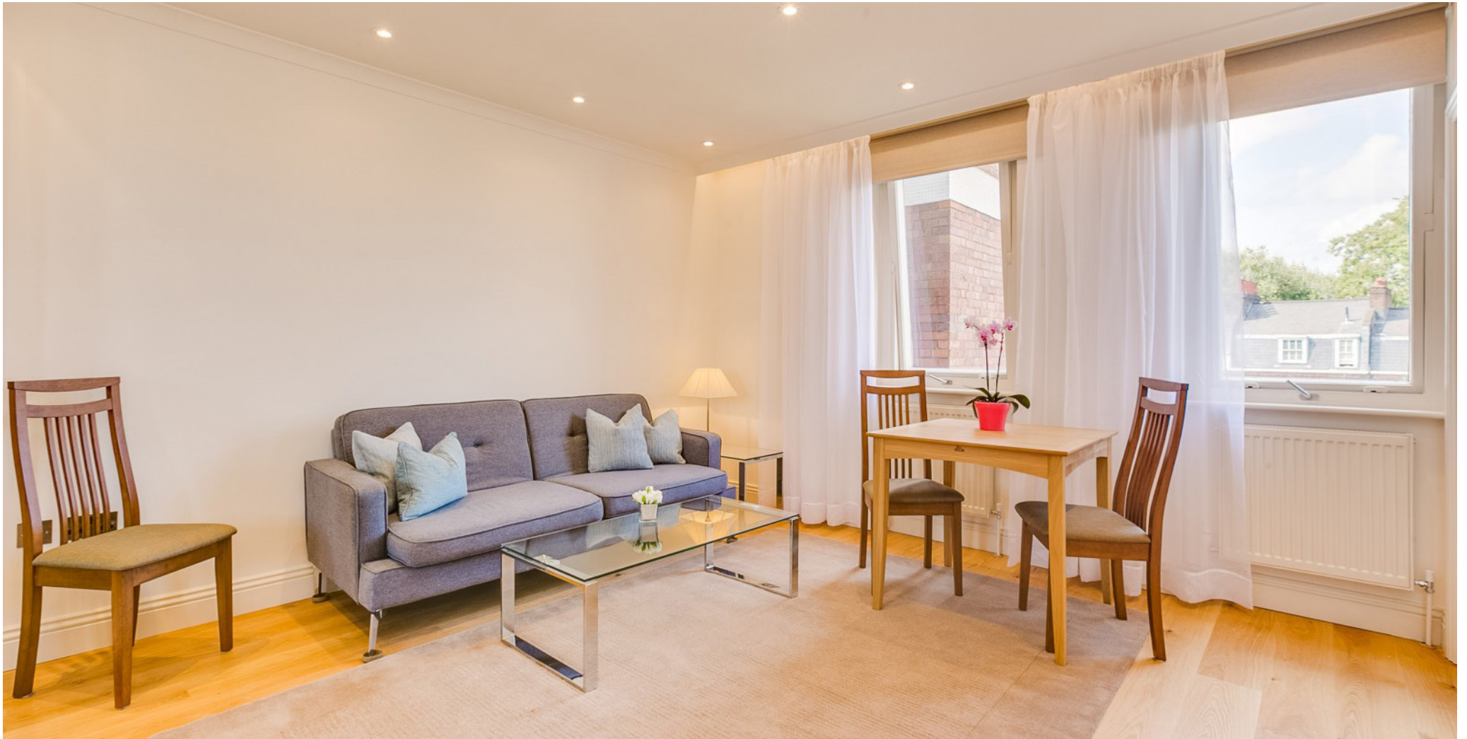
BELGRAVIA COURT, Belgravia SW1W