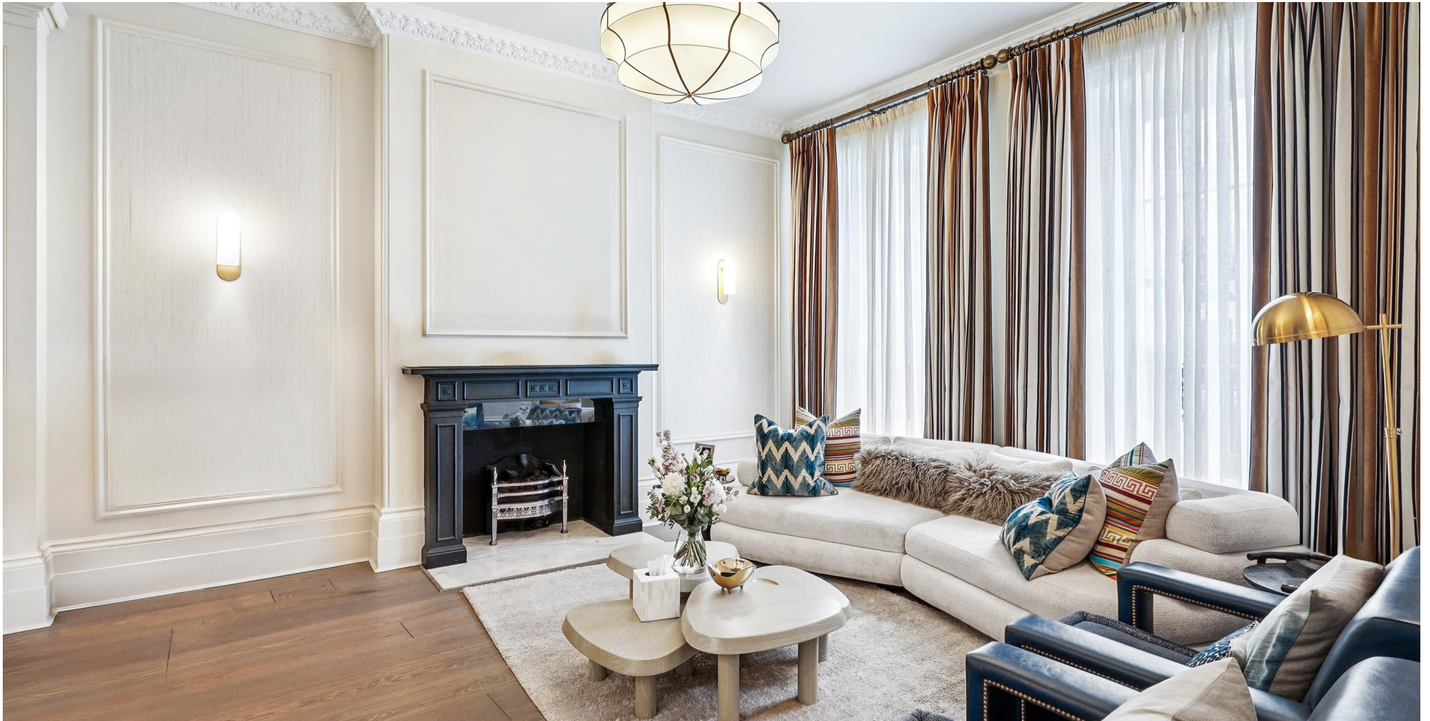
WILTON CRESCENT, Belgravia SW1X