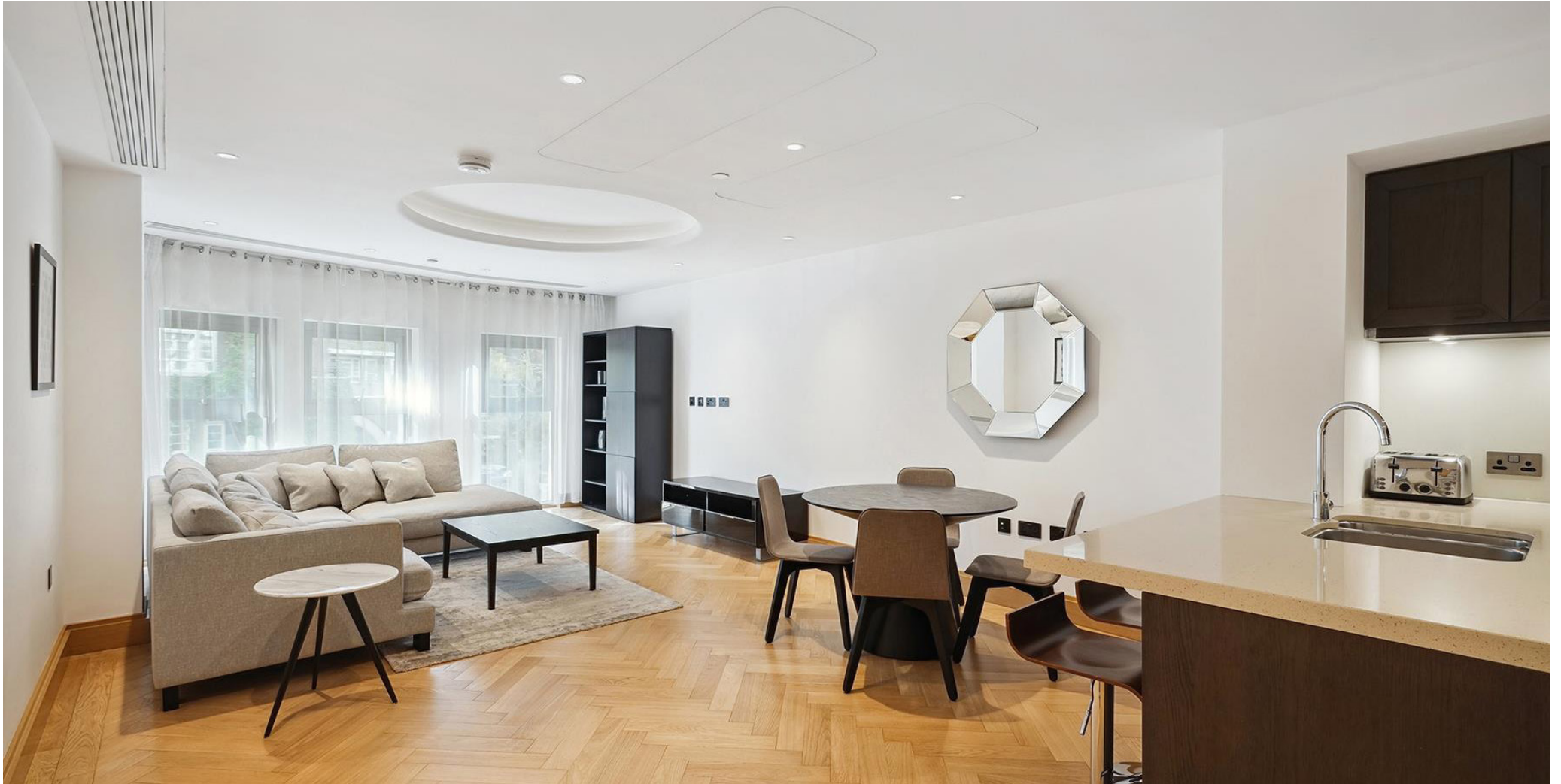
ABELL HOUSE, Westminster SW1P