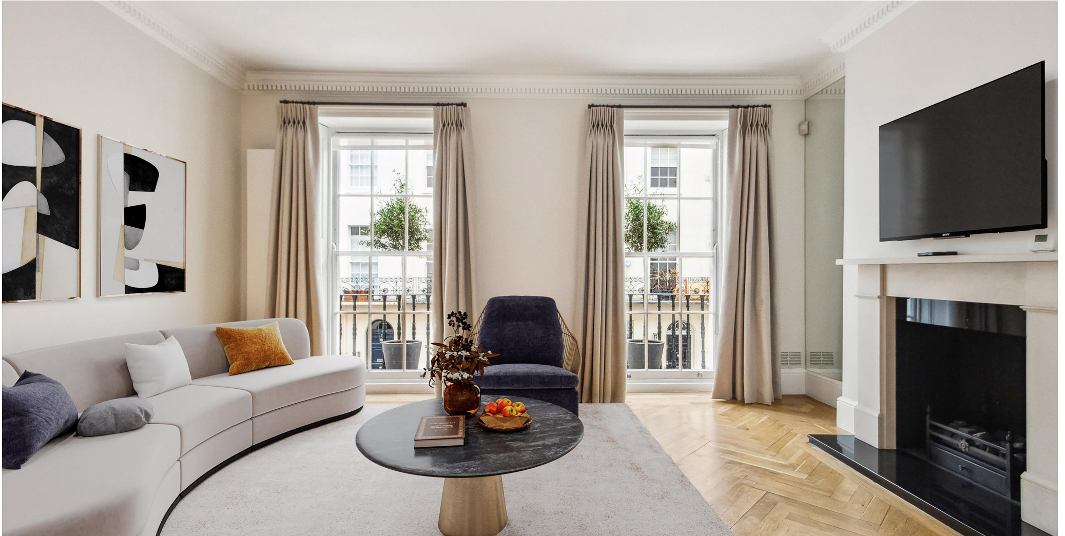
CHESTER ROW, Belgravia SW1W