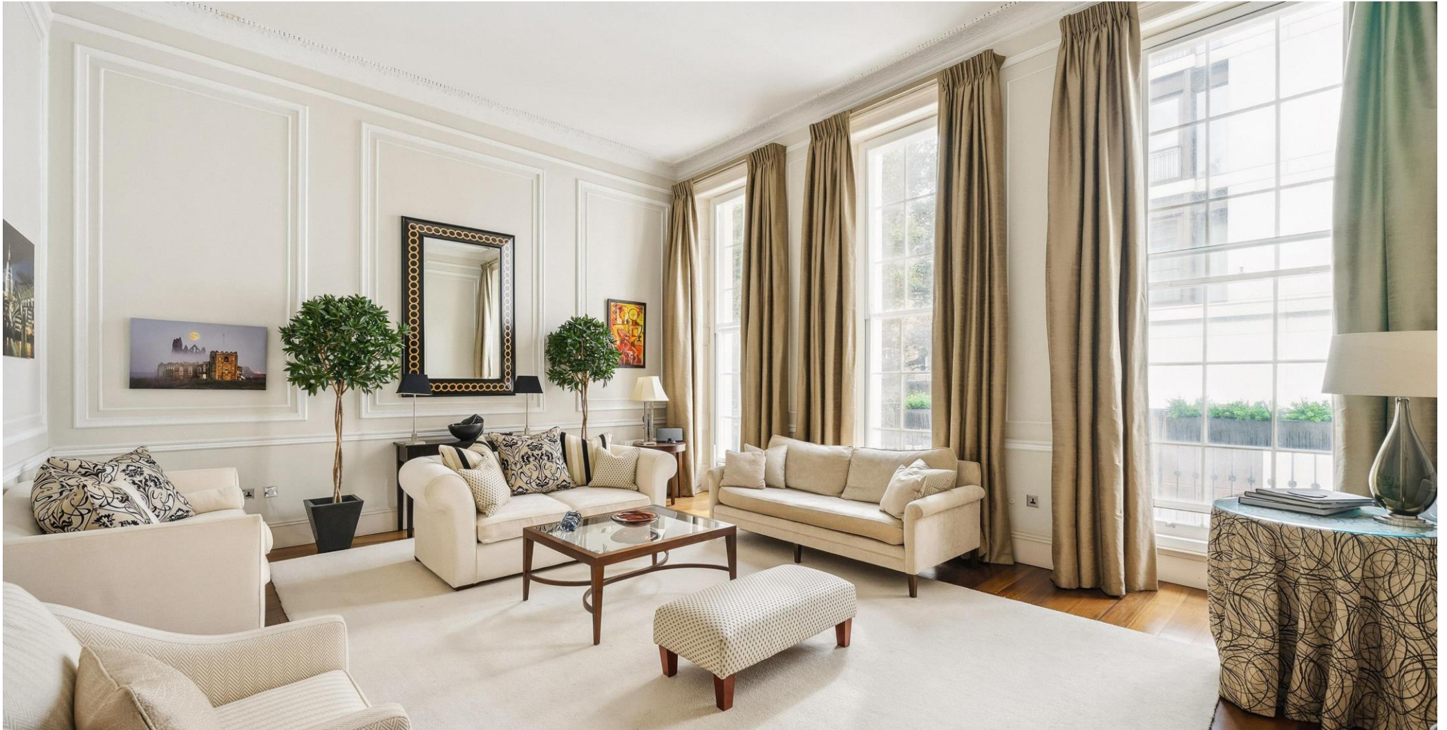
HALKIN STREET, Belgravia SW1X