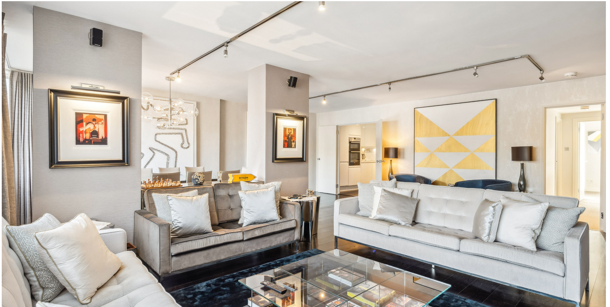
EBURY STREET, Belgravia SW1W