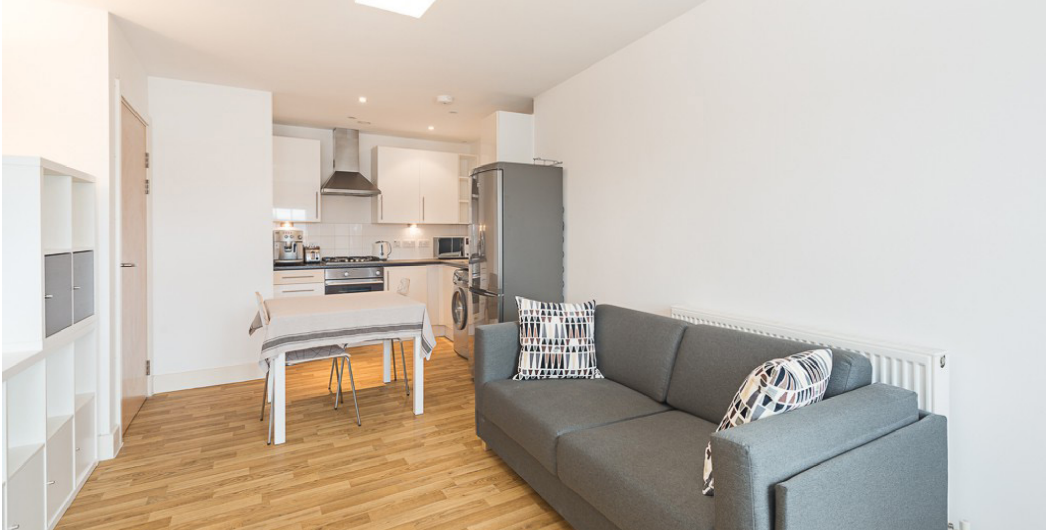
PEEL HOUSE, Westminster SW1P