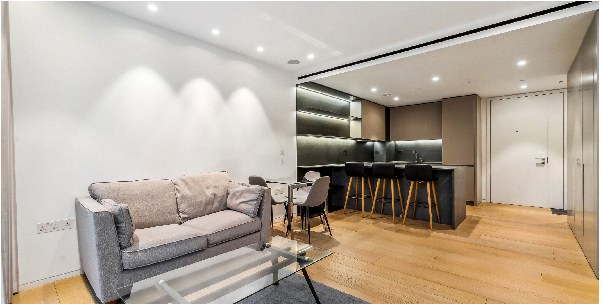
NOVA BUILDING, Victoria SWIW