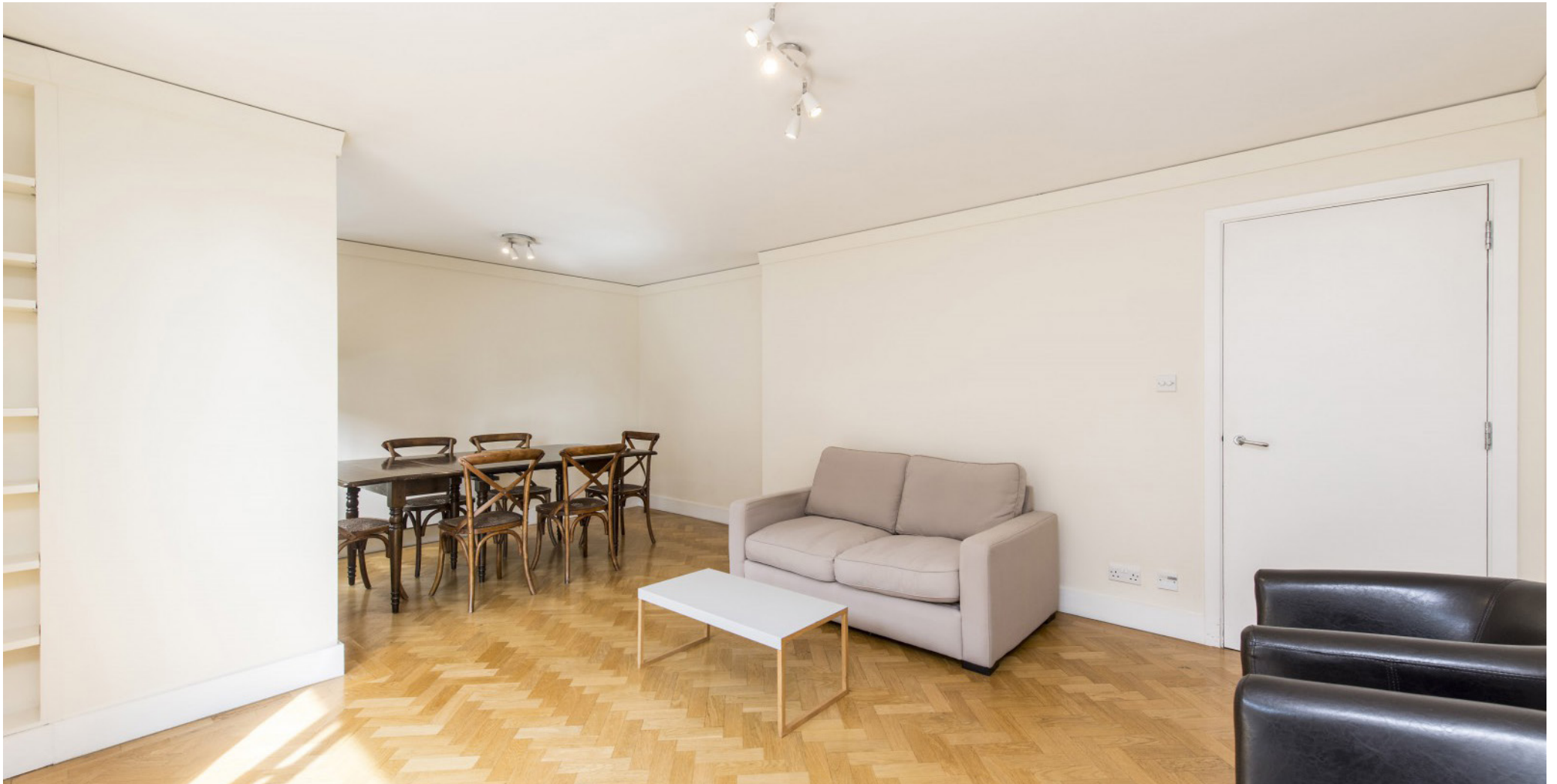
ARTILLERY MANSIONS, Victoria SW1H