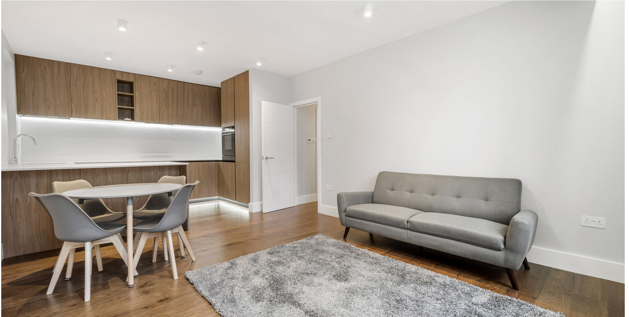
BELGRAVIA COURT, Belgravia SW1W